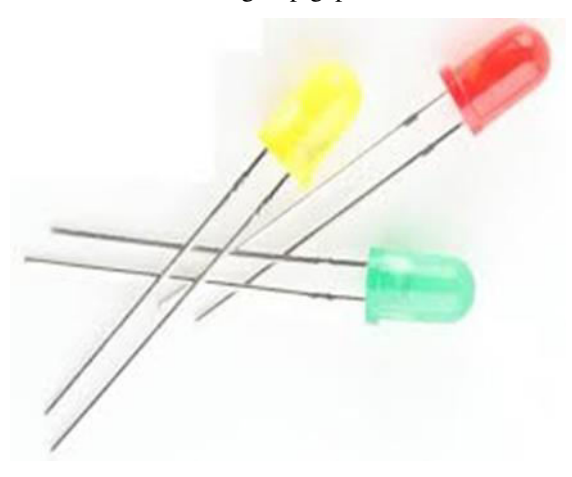
Fig -6: LED Lights

A semi-conductor light source that produce light when current emits through it is called light-emitting diode (LED). Electrons in the semiconductor recombine with electron holes, release energy in the type of photons. The colour of the light is determined by the energy required for electrons to cross the group gap of the semi-conductor [7].