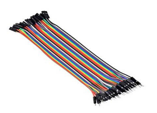
Fig -7: Jumper wires

Volume: 04 Issue: 04 | April -2020 ISSN: 2582-3930