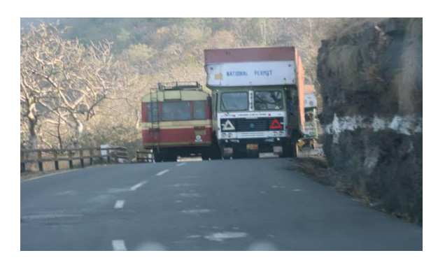
Fig -2: ROAD ACCIDENT IN GHATS SECTION

Z Volume: 04 Issue: 04 | April -2020 ISSN: 2582-3930