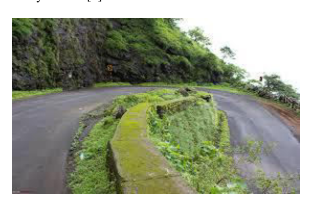
Fig -1: Ghat road

Ghats Roads are access route into the mountainous with amount of hairpin bends, which is very risky as compare to normal routes. So chances of accidents in Ghat section is more because of narrow road width, sharp bends, improper camber, valley side etc[2].