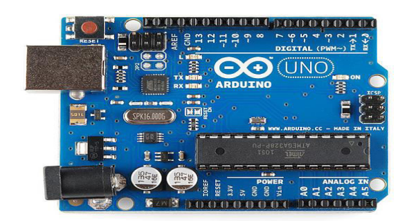
Fig -5: Arduino Uno Board

The Arduino Uno is an open source microcontroller board which is used to insert the code as input using USB and can get the excepted output. This platform consists of physical programmable path board and or IDE (Integrated Development Environment) that runs on computer, used to mark and upload computer code to the physical board [6].